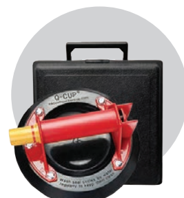
VERSUS OTHER BRANDS