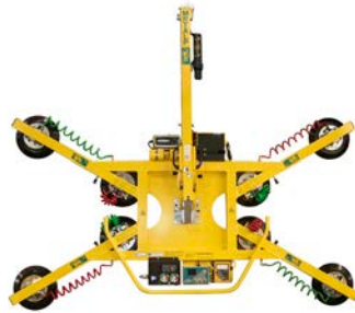
Low-Profile Manual Rotator/Tilter 1100 (DC) w/ Intelli-Grip™ ..... MRTALP811LDC3