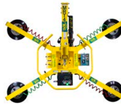
MRT4 Lifter Series Rotator/Tilter 500 (DC) ..... MRT49DC Rotator/Tilter 700 (DC) ..... MRT411LDC 700 (DC) w/ Intelli-Grip™ ..... MRT411LDC3