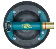
Vacuum Hand Cups 8" Flat – ABS (plastic) handle – 125 lb..... GN4000 8" Flat – metal handle – 125 lb ..... GN4950 9" Flat – metal handle – 150 lb ..... GN5450 10" Concave – metal handle – 175 lb..... GN6450