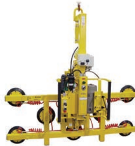
Manual Rotator/Power Tilter (AC) 1000 (AC) ..... MRPT89AC