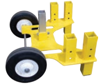
MRT Dolly ..... 98790