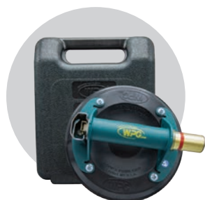
WOOD'S POWR-GRIP SUCTION CUPS

The safety factor rating tells you how much stronger something is than it needs to be to stay safe. This protects users who lift loads in less than ideal conditions.